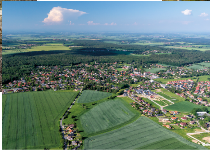
Mukarov, Czech Republic